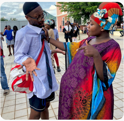
'It's not mine!' 'No, it's yours, and you know

The costume party set the mood for the rest of the weekend, and from the energy on that first day, it was clear that students were ready to make every moment count.